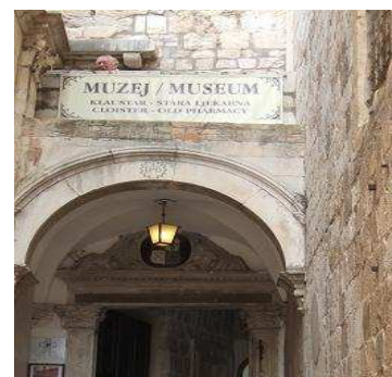
Pharmacy museum in monastery in Dubrovnik Old City